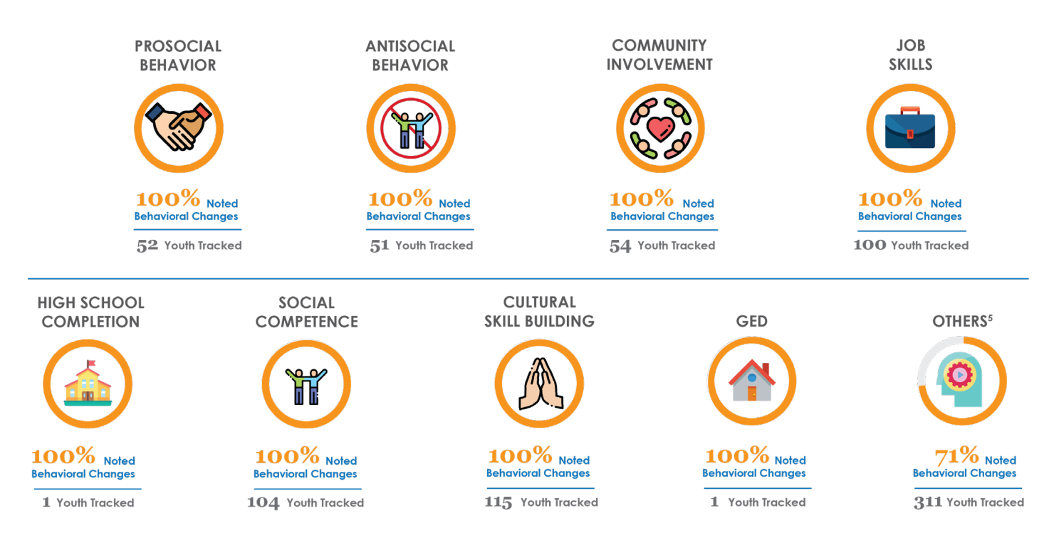
Figure 3. Outcome Percentages for the Specified Target Behaviors